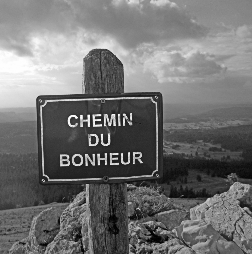
PATHWAY TO HAPPINESS, Crête de la Dôle, Jura, 2013

Throughout your reading, you will find a series of serious messages that we have tried to convey with humility and sincerity.